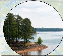
LAKE LANIER, GA

THE EAST COAST REGION OF NC, SC, AND GA HAS OVER 6,000 MILES OF SHORELINE. PLUS, THE REGION HAS 9,000 SQ MI. OF INLAND WATER