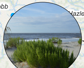
SAINT SIMONS ISLAND, GA

FREE COPIES ARE PROVIDED AT OVER 500 MARINE DISTRIBUTION LOCATIONS